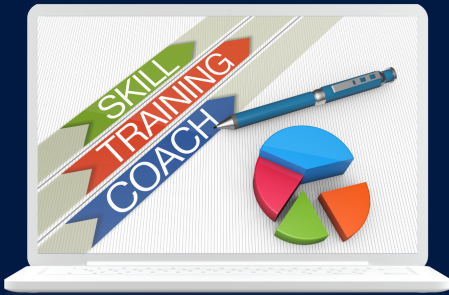
JOB SKILLS & TRAINING